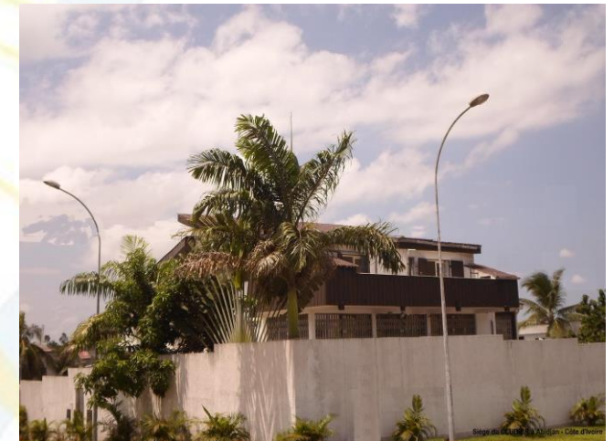
HQ in Abidjan

Objective: to accelerate the development of access to electrical energy services in the rural areas, by creating the relevant framework conditions and by systematizing the beneficial pooling of experience among agencies and structures in charge of RE